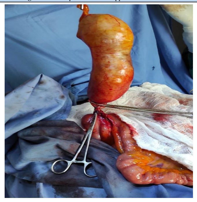
Figure 2: Ligated base of Appendix Mucocele