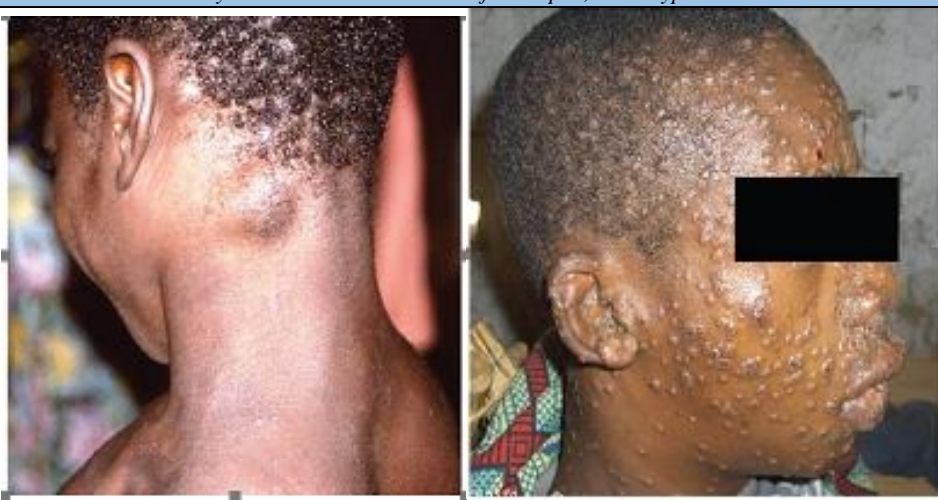
Figure 1: Cervical Lymphadenopathy in a Patient with Active Monkey pox