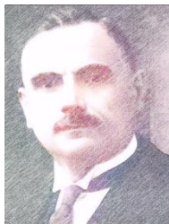
Figure-2: Bartolomeo Gosio (17 March 17, 1863-April 13, 1944), an Italian medical scientist