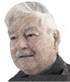
Figure-3: Everett Linn Jones from the United States

Everett Linn Jones from the United States (Figure-3) and his research groups were the first to report the use of mycophenolate mofetil in the treatment of psoriasis during the 1970s. They reported the treatment of 29 patients with psoriasis treated with oral mycophenolate mofetil for at least three months. The daily dose of mycophenolate mofetil was increased from 1.6 to 4.8 g depending on occurrence of adverse effects. One patient experienced total clearing of the skin lesions, and 14 patients experienced almost total clearing of the skin lesions, definite improvement was observed in 13 patients, and slight or doubtful improvement was observed in one patient. However, discontinuing treatment was associated with relapses that were observed at a median time of one month (Range: 3-8 weeks). Side effects included nausea, anorexia, and soft or frequent bowel motions or diarrhea. One patient experienced reversible, dose-related leukopenia [9, 10].