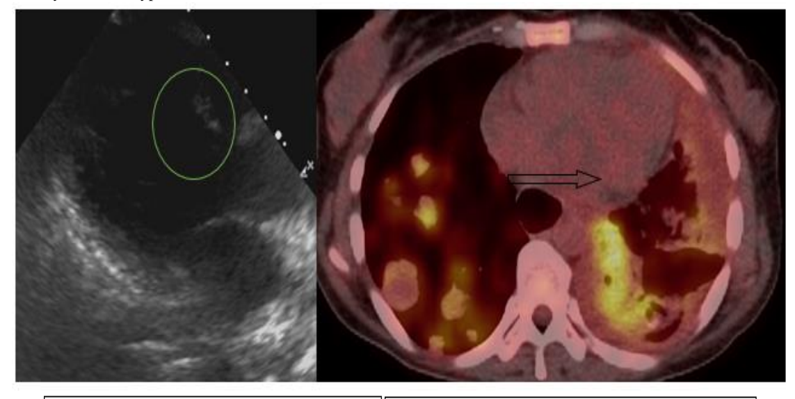
Figure 2a: 2D ECHO shows significant decrease in size of mass almost negligible in comparison to previous mass.

treated with FOLFIRI based chemotherapy and Panitumumab. Following 6 cycles of treatment, the patient exhibited disease response on PET CT, resulting in a subsequent reduction in the size of the cardiac lesion and improved symptoms. An echocardiogram demonstrated regression of the cardiac disease