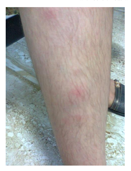
Figure (2A): Macular rash consisting of pink rings mostly on the extensor surfaces.

The patient developed fever and arthritis of one elbow (Painful and swollen) on the 22^{nd} of August, 2023 followed shortly by the development of macular rash consisting of pink rings mostly on the extensor surfaces and arthritis of the second elbow. The face was not involved by the rash. She was treated with oral antibiotics and analgesics without obvious improvement. The patient was brought to us on the 26^{th} of August, and she still had painful swollen elbows and rash (Figure-2). The patient had a previous febrile illness associated with sore throat which occurred during the previous 2 to 3 weeks.