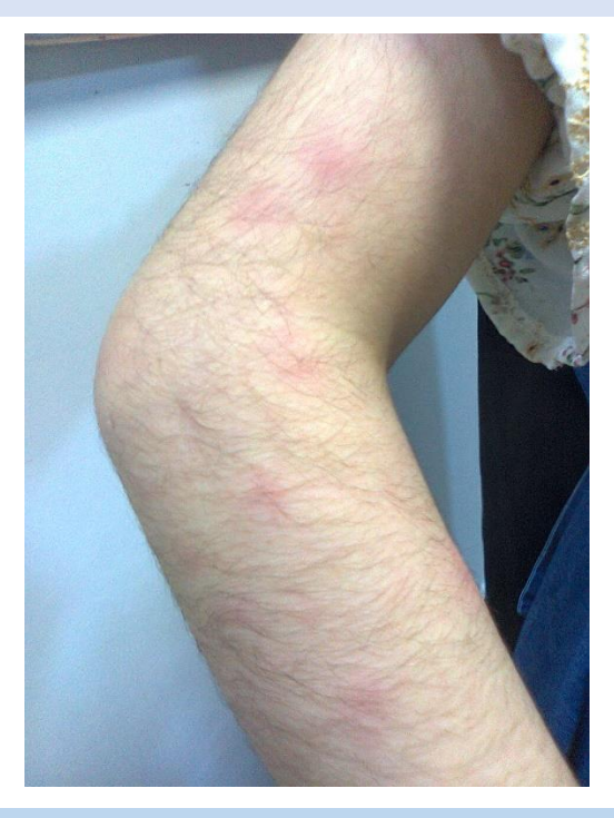
Figure (2B): Macular rash consisting of pink rings mostly on the extensor surfaces