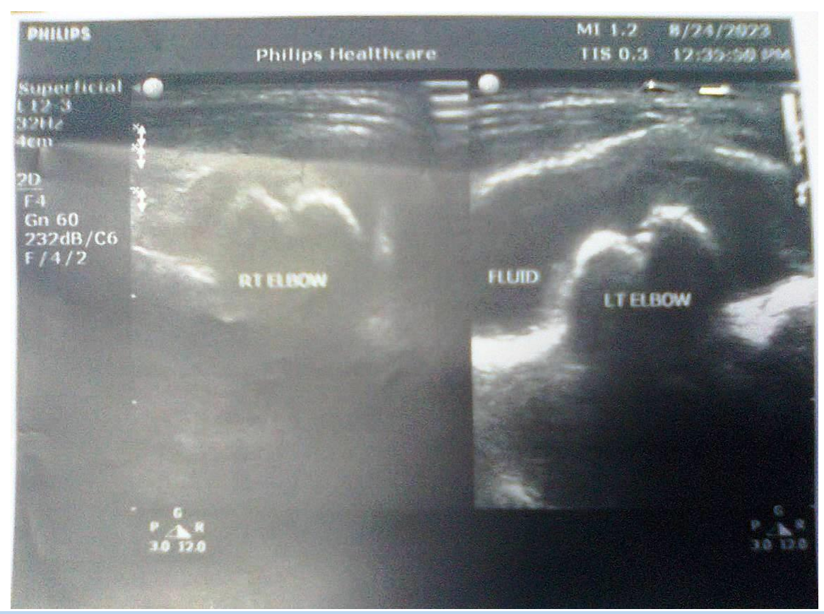
Figure 4: Ultrasound of the elbows showed fluid collection suggesting joint effusion

Erythrocyte Sedimentation Rate (ESR) was 19 cubic mm/hour.