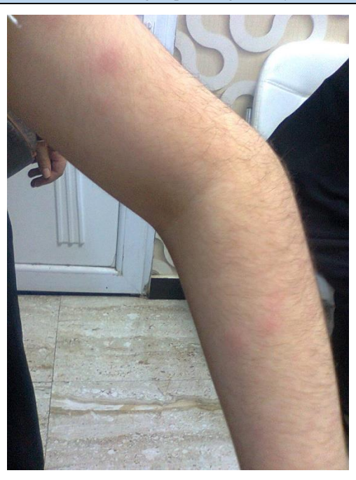
Figure (2C): Macular rash consisting of pink rings mostly on the extensor surfaces

ASO titer was 150 iu/ml and CRP was positive 300 mg/dL.