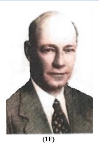
Figure (1E): Frederic John Poynton (June 26, 1869-October, 29 1943), an English physician; ( 1F): Thomas Duckett Jones (February 2, 1899-November 22, 1954) was an American physician, cardiologist.

Jones diagnostic criteria have been revised and modified in 1965, 1984, 1992, and 2002. The diagnosis of acute rheumatic fever is generally based on the presence of either two Major criteria (multiple joint arthritis, carditis, erythema marginatum, chorea, and subcutaneous nodules) or one Major criteria and two Minor criteria (Fever, arthralgia, first degree heart block, elevated inflammatory markers [ESR and C-reactive protein]) plus appropriate evidence of preceding streptococcal infection [11-14].