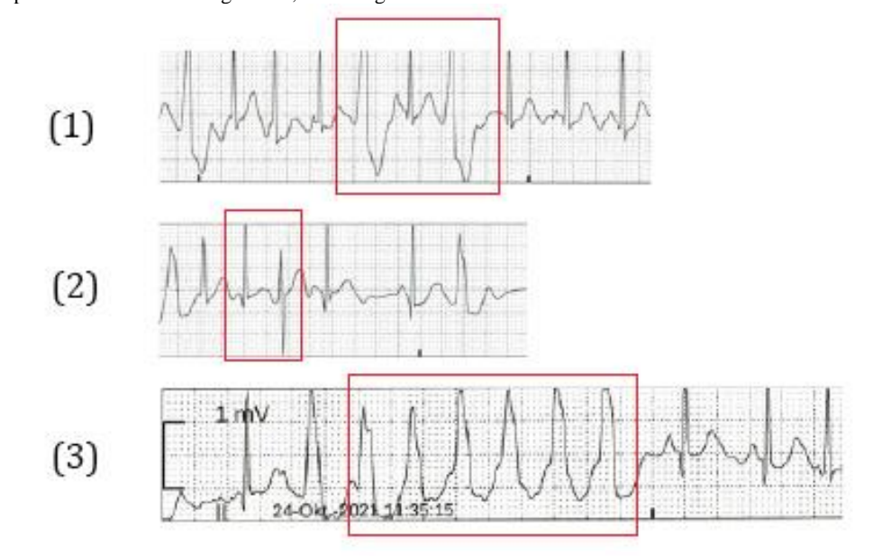
Figure 2: Examples for arrhythmogenic events: (1) Recurrent ventricular extrasystoles, (2) 180° turn of QRS-vector, (3) Ventricular salvo.

electrophysiological study and cardiac magnetic resonance imaging. During electrophysiological investigation, a stress test using orciprenalin was performed revealing intermittent prolonged QTc to a maximum of 700 ms (amiodarone effect?). Therefore, Long QT syndrome was suspected. During continuous monitoring on our pediatric ward, occurrence of several arrhythmic events was noticed (Figure 2). Mostly, arrhythmogenic events precipitated by preceding stressing incidents (i.e. blood sampling, IV access, etc.), thus, offering the clinical possibility of CPVT. With the main suspicion of an ion channelopathy, genetic diagnostics was performed to identify the causative mutation. The patient received pharmaceutical therapy using propranolol with a dosage of 3 mg/kg of body weight [12]. No adverse effects were seen. On the last follow-up, the 50 h spanning Holter-ECG was graded 2 in the Lown grading system.