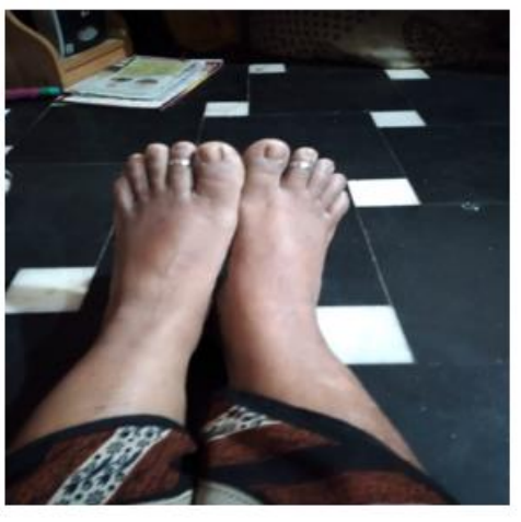
Figure-4: 25 March 2022 Cracks in Toes