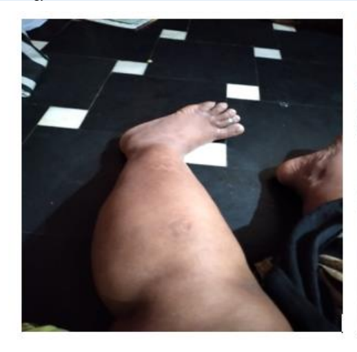
Figure-3: 25 March 2022 Pedal Oedema