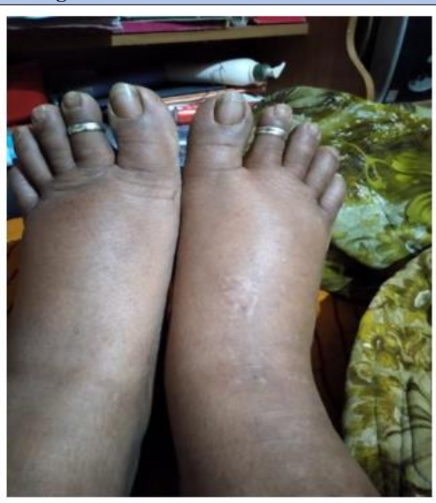
Figure-5, 9: April 2022 Lt. Leg Reduced Oedema