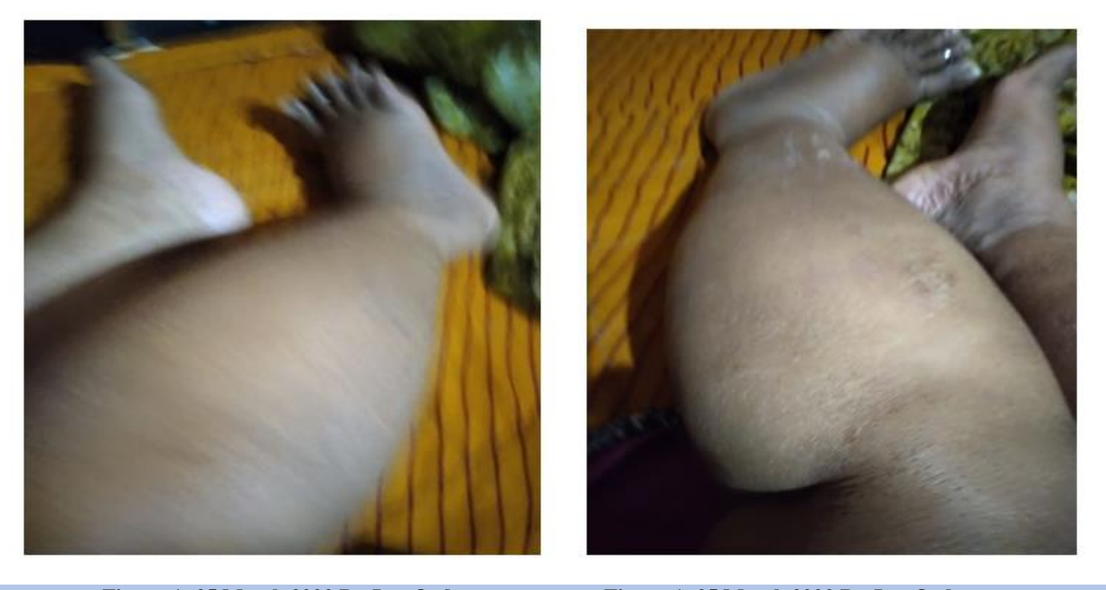
Figure-1: 25 March 2022 Rt. Leg Oedema

Based on the photographs shared (Fif-1-4 see next page) and a video consultation, I assessed both lower limbs, and found that both limbs were swollen though it was more in left lower limb with the compliant as affected limb. Disproportionate swelling was noted from the ankles to the waist when compared with the torso above. A lack of pitting lymphedema, Painless, slightly restricted range of motion, were noted. I suspected some low-grade infection / inflammation (Filarial lymphedema) as the area is endemic for Filarial infections. Keeping her occupation and the cracks & fissures in her sole's toes and the environment in which she works daily, I suspected chronic inflammation. Therefore, I referred her to super specialty hospital attached to the Medical College. On 25 March 2023, she consulted an endocrinologist. With clinical a differential diagnosis of i) subclinical hypothyroidism ii) Superficial Chronic venous disease/post-thrombotic syndrome iii) Diffuse Cellulitis iv) Idiopathic edema were considered and advised a venous doppler. The Venous doppler ruled out Thrombophlebitis as CPV, SPV, PV and PTV courses were normal. Narrowing down the diagnosis to Diffuse Cellulitis she was advised MgSo4 crape bandage and antibiotics for 10 days. By 9th April 2022 the swelling had reduced a lot as seen in the fig 5-6. And by 26th April her feet were normal (Fig-7)