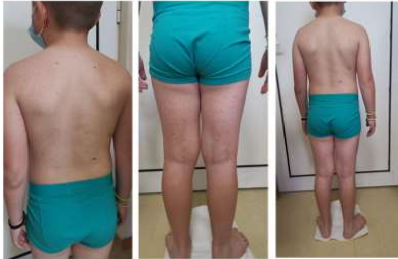
Figure: 1 (A, B and C) Skin lesions are presented with symmetrical, disseminated yellow-tan to red-brownish macules and papules were established on back and upper limbs (A), lower limbs (B) and trunk (C).

On physical examination symmetrical, yellow-tan to red-brownish macules and disseminated on the trunk and distal extremities were observed. There was no mucosal or soft tissue involvement (fig. 1 - A, B, C).