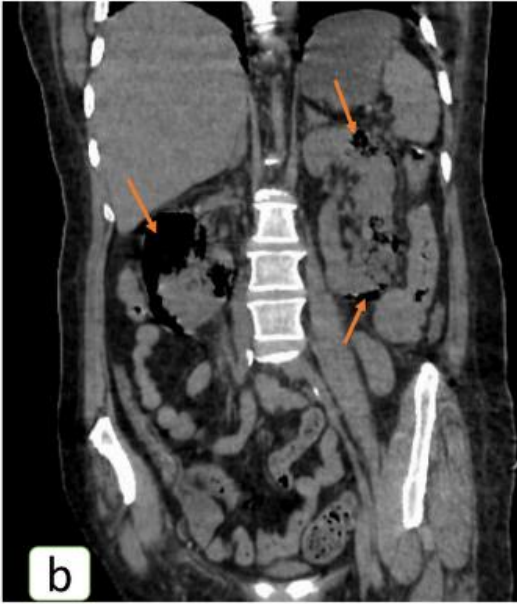
Figure 1: Abdominal and pelvic CT no enhanced scan in axial section (a) and coronal reconstruction (b), in a 62-year-old woman followed for type 2 diabetes, admitted to the emergency room in a state of shock; showing the presence of gas (arrows) in the right and left renal parenchyma posing the diagnosis of emphysematous pyelonephritis of stage 4.

The patient was admitted to an intensive care unit with a therapeutic strategy of resuscitation measures and broad spectrum probabilistic antibiotics. She underwent bilateral percutaneous drainage of kidneys, as well as haemodialysis sessions to correct the hydroelectrolytic disorders. The evolution was marked by a worsening of the infectious state with an increasing need for vasoactive drugs and the occurrence of death after 48 hours as a result of septic shock.