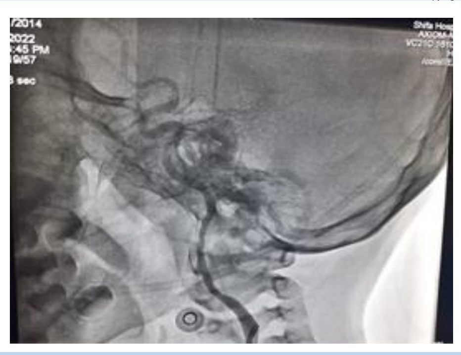
Figure 1: MCA proximal totally occluded