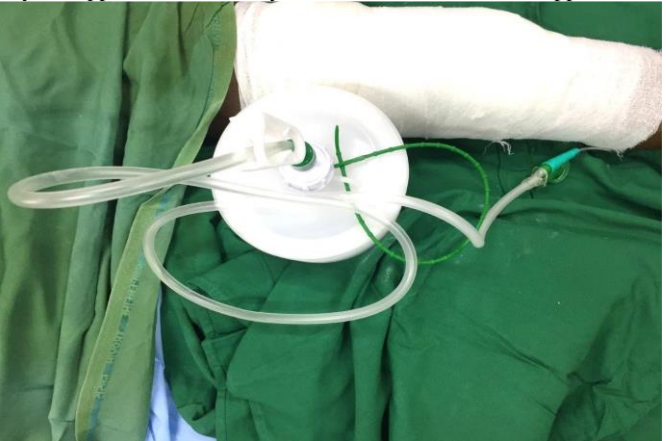
Figure 7: Connection to simple vacuum suction drain device.

intermittently based on amount of wound discharge. Conventional VAC dressings use a computerized VAC device but, in our study, we modify the conventional technique by using cost - effective wall suction apparatus or a simple suction drain device [Figure 7].