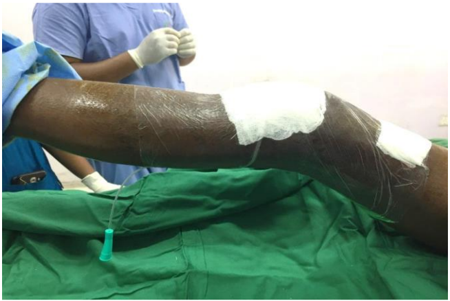
Figure 6: Application of sterile semipermeable transparent adhesive membrane dressing.

3. The foam with the surrounding normal skin is covered with adhesive, semipermeable, transparent membrane. A good air seal must be ensured around the wound [Figure 6].