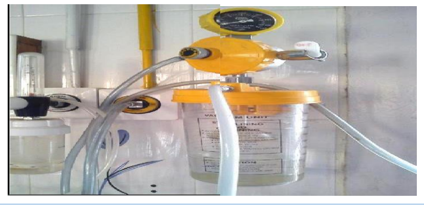
Figure 2: Central suction unit