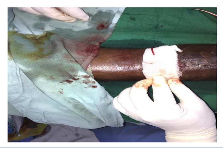
Figure 5: Application of gel foam

3. The foam with the surrounding normal skin is covered with adhesive, semipermeable, transparent membrane. A good air seal must be ensured around the wound [Figure 6].