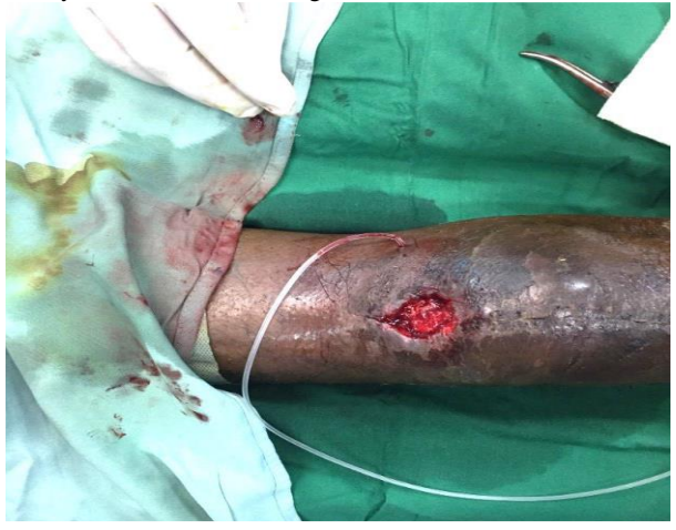
Figure 4: Debridement and application of drain tube.

1. The wound is thoroughly debrided, and devitalized tissue removed. A perforated drain tube is placed on top of the wound bed and other end is brought out subcutaneously a little away from main wound [Figure 4].