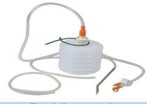
Figure 3: Vaccum suction drain