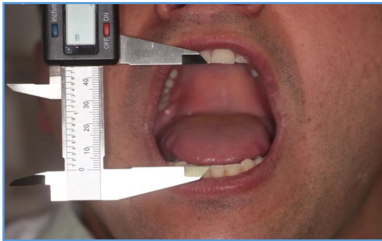
Figure 2: Measurement of maximum mouth opening done with the digital Vernier caliper.