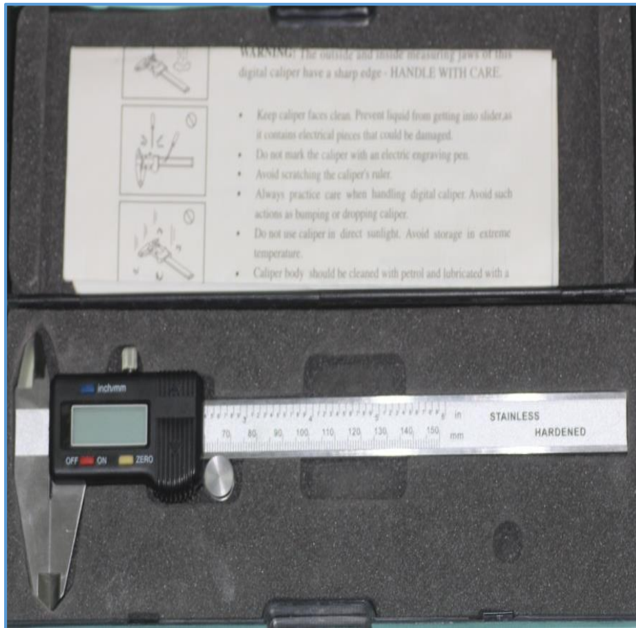
Figure 1: Digital Vernier caliper.

MMO was recorded by asked each subject to open his or her mouth as wide as possible while the examiner measured the maximum distance from the incisal edge of the maxillary central incisors to the incisal edge of the mandibular central incisors at the midline incisor during maximal mouth opening up to the painless limit ( Figure 2 ).