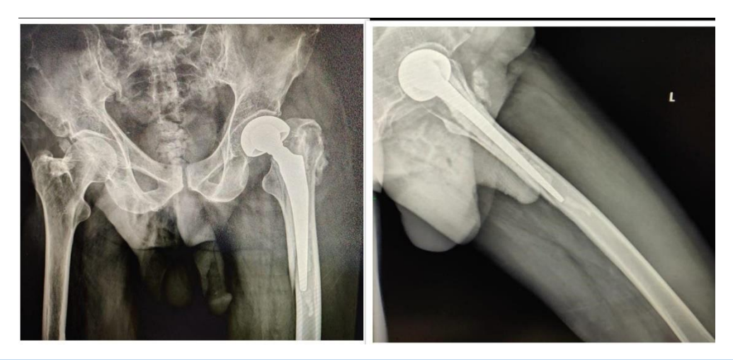
Figure 1: pre-operative radiographs showing atypical fracture configuration.

which was operated previously for distal humerus fracture in outside hospital. The radiographic studies showed a fracture of the greater trochanter and femoral shaft, in cemented hemi arthroplasty and comminuted left distal ulna and radius fracture. The bone lesions over hip were outside the classified definition with two different fracture types, Vancouver type- A1 (greater trochanter) and -B2 (periprosthetic femoral fracture) in a same occurrence (Figure 1).