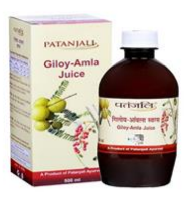
Figure 2: Herbal marketed medicines of Giloy ghanvati tablets and giloy-amla juice by PATANJALI pvt Ltd.