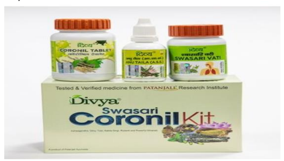
Figure 3: Herbal medicine for COVID-19 (Divya swasari coronil kit)

Among infected patients, COVID-19 manifests various unspecific symptoms, ranging from mild to severe which includescough (76%), fever (98%), sputum production (28%) and headache (8%). Presently, there is no specific treatment for COVID-19, people in the society and researchers are trying to find best way to cure the disease by using herbal medicines [26].