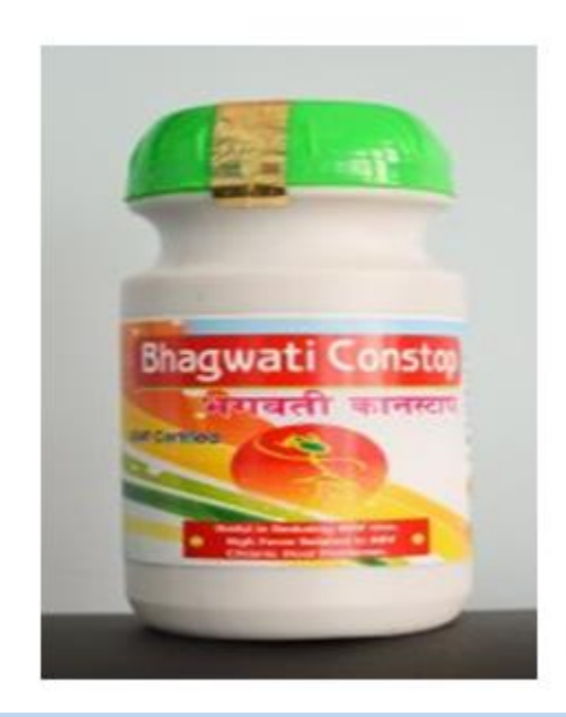
Figure 4: Marketed herbal medicine used for the treatment of HIV and herpes simplex viruses