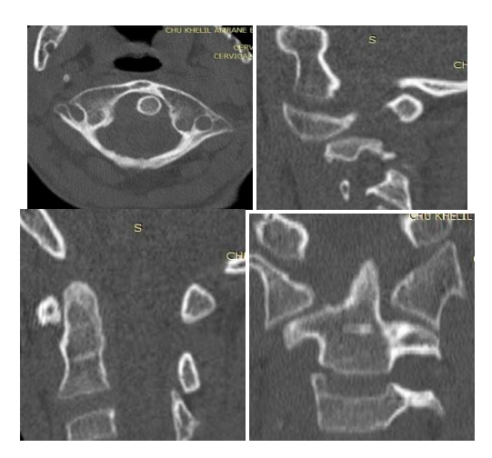
Control CT: under traction

dislocation and disappearance of muscle contracture. the child was kept under orthopedic restraint with a philadelphia type mineral with chin support for 03 months.