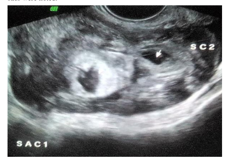
Figure 3: Trans vaginal Sonography shows Right adnexa heterogenous mass with two irregular sacs and hemoperitoneum. Left ovary is visualised.

Histopathology report came out to be right adnexal two gestational sacs were noted.