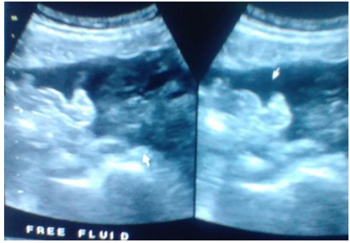
Figure 4: Trans vaginal Sonography shows both adnexae heterogeneous mass with two irregular sacs and hemoperitoneum. Both ovaries are visualized.