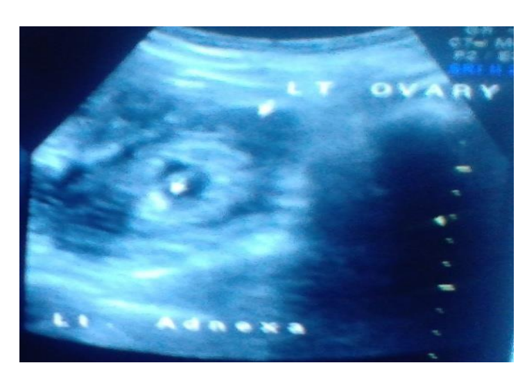
Auctores Publishing - Volume1-10008 www.auctoresonline.org Page - 03