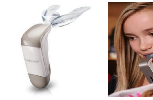
Figure: 5 Accledent

applied by the control signal through the power amplifier controlled by the output signal from the accelerometer, thereby maintaining the acceleration at 1.0 meter per square second (m/s2). A vibration-imposed system consists of a vibration controller, charge amplifier, vibrator, force sensor and accelerometer. The top of the vibrator was fixed on the tooth with an adhesive. The vibration tests were carried out for 5 minutes, and the resonance curves were displayed as frequency-force relationships on the monitor of the vibration controller. Clinical trials were conducted by various researchers on human population using oral vibrating devices such as AccledentTM, AcceleDent® and electric tooth brushes and found to be effective in increasing the rate of tooth movement [15].