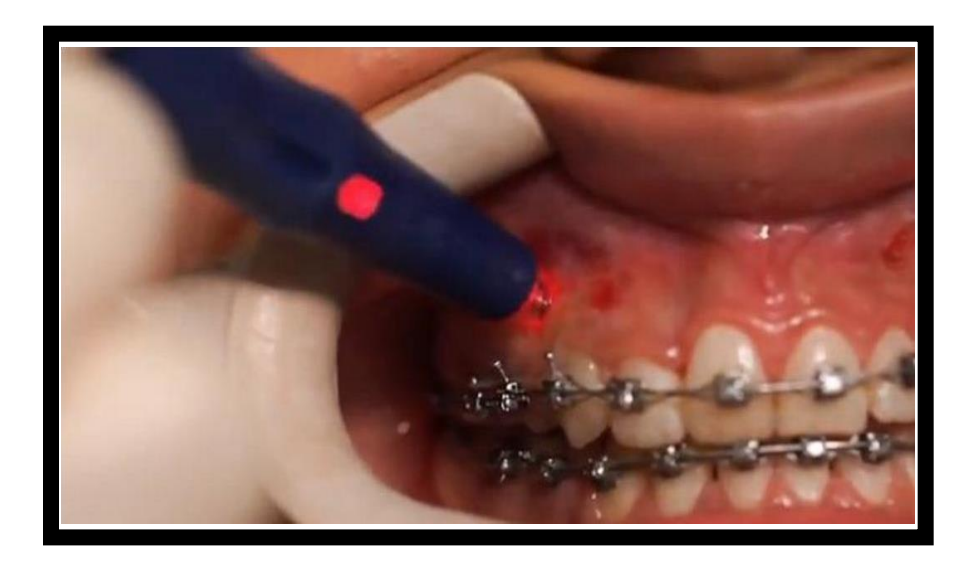
Figure: 4 Micro-osteoperforations

Contemporary status of surgical methods: Surgical methods are invasive procedures and hence, patient cooperation is much needed. Interseptal alveolar surgery, corticotomy and corticision are more invasive and expensive with needed surgical cuts and osteotomies. Post-operative complications are sometimes present with pain, swelling and patient discomfort. Recent techniques such as piezocision and microosteoperforations are less invasive with comparatively less complications than the previously used procedures. But more research is required to be done in using those techniques for accelerating the orthodontic tooth movement.