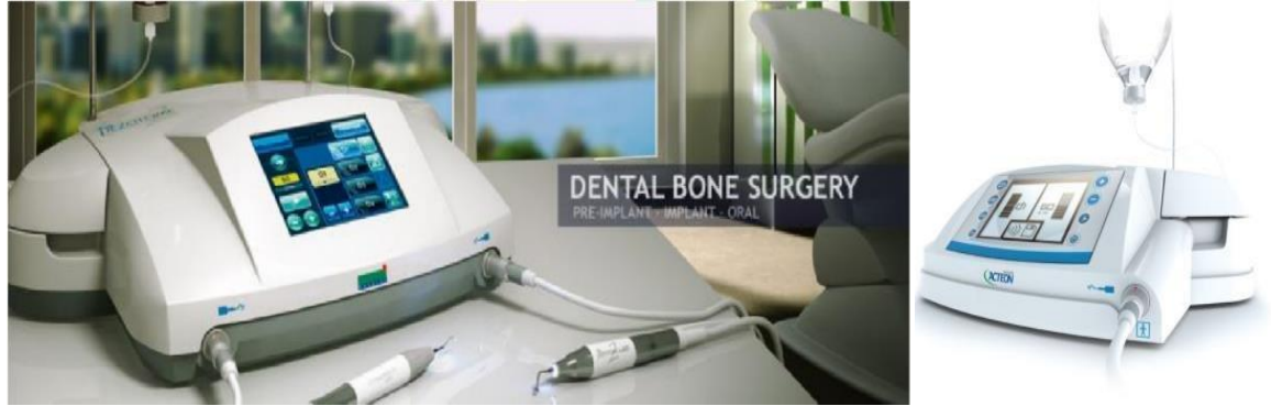
Figure: 3 Piezotome

Procedure: This is a combination of microincisions limited to the buccal gingiva that allows the use of a piezoelectric knife to give osseous cuts to the buccal cortex and initiate the RAP without involving palatal or lingual cortex. The procedure allows for rapid tooth movement without the downside of an extensive and traumatic surgical approach while maintaining the clinical benefit of a soft-tissue or grafting concomitant with a tunnel approach. Dibart and co-workers[12] established a minimally invasive flapless procedure, combining micro incisions, piezoelectric incisions and selective tunneling that allows for hard- or soft-tissue grafting. They concluded that piezocision allows a rapid correction without the drawbacks of traumatic conventional corticotomy procedures in severe malocclusion cases. They later combined this technique with invisalign and found to be more effective and esthetic.