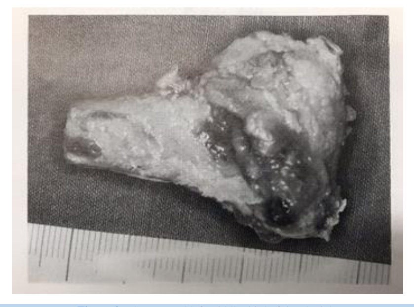
Figure 2: The resected left middle third of the clavicle.

After removal of the previous surgical scar, the surgical access consisted of a standard transverse cervicotomy (Knocker's incision). The left anterolateral incision of the neck was occupied by a voluminous goiter extending from the thyroid left lobe and isthmus and encompassing most of the mediastinum. On the right, where the previous operation had been carried out, thyroid material was absent but an inextricable sclero cicatricial process was present, with diffuse involvement of the vasculo nervous bundle.