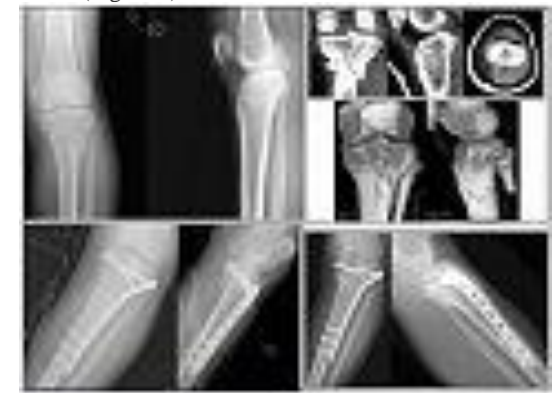
Figure 1 : Schatzker V fracture.

1. First visit was within 14 days from surgery for check up of the wound and removal of stitches if wound looked healed. Range of Motion (R.O.M.) was checked and recorded. Second visit was at 6-8 weeks, third visit was at 4-6 months with the start of F.W.B., fourth visit was at 9 months and fifth visit was at 12 months unless complications occurred (Figure 1).