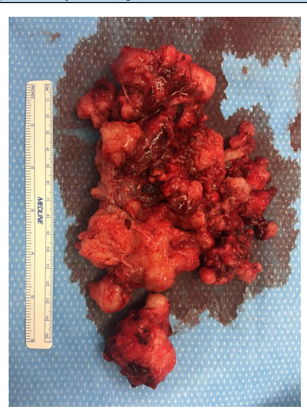
Figure 6: Image of the resected mass