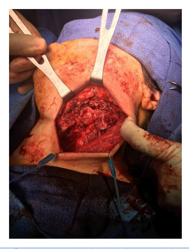
Figure 5: Intraoperative image of the neck after resection of the mass