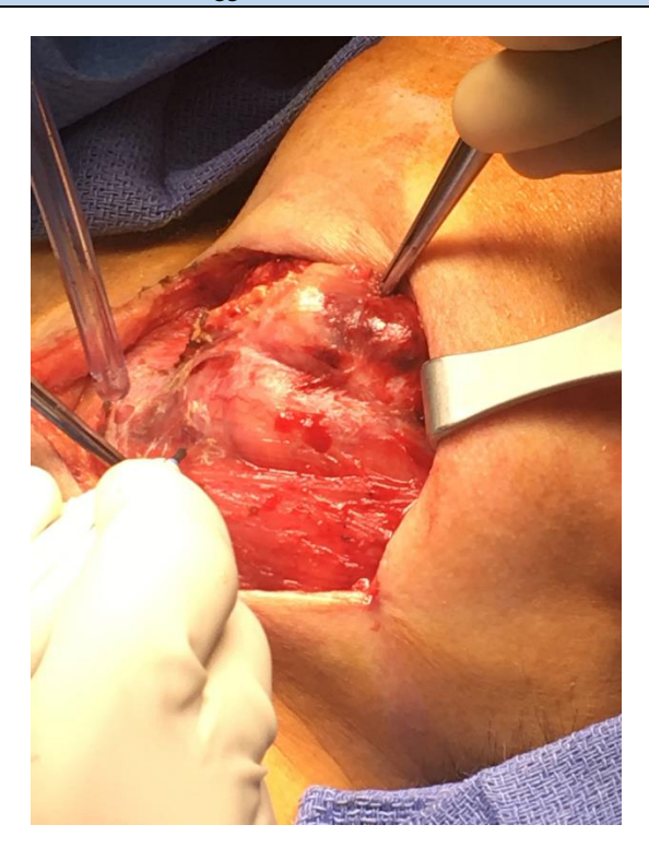
Figure 4: Intraoperative image of the neck mass prior to resection