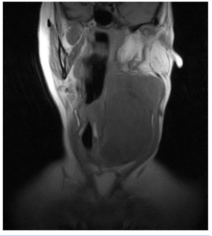
Figure 1: T1 Non-contrast MRI demonstrating left neck mass with compression of midline structures

multidisciplinary teams may improve decision making for these patients. The treatment of AF in the head and neck region is a topic that requires more attention and research.