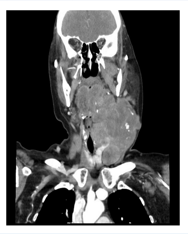
Figure 3: CT Scan with contrast demonstrating Recurrence of Aggressive Fibromatosis