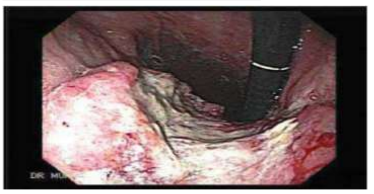
Figure 2: Endoscopic picture of malignant gastric fundus ulcerated lesion (retroflexion).

Figure 1: Endoscopic images a) Active ulcer, b) Ulcer scar, c) Last stage of the mucosal healing in benign peptic gastric ulcers