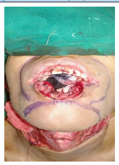
Figure 5: Marking at Naso-labial folds