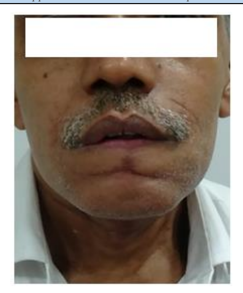
Figure 8: Follow up picture after 1 year