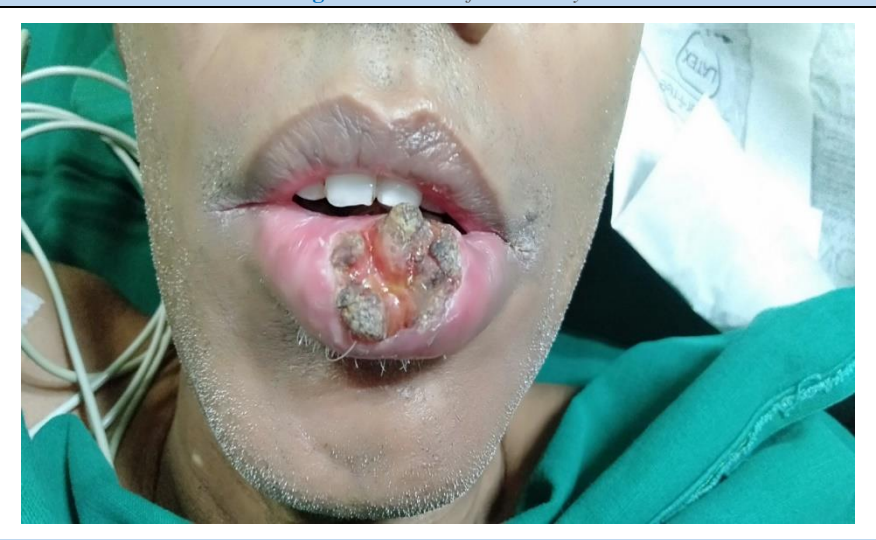
Figure 2: Central lower lip ulero-proliferative growth

After excision of the lesion [Fig. 3, 4], bilateral nasolabial folds are mobilised maintaining neurovascular structures. These mobilised full thickness circumoral advancement flaps are rotated and a new lower lip was reconstructed [Fig. 5, 6]. Every care was taken to maintain the oral competency [Fig. 7]. Patient was started on oral feeding from postoperative day two. Postoperative course was uneventful and he was discharged on 5<sup>th</sup> postoperative day. Final histopathology report was indicative of moderately differentiated squamous cell carcinoma with tumor size 3 x 2.5 x 1.5 cm and all margins were free from tumor except inner mucosal margin which was 0.3cm away from the tumor ( close