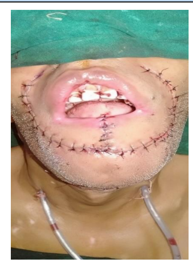
Figure 7: Approximation with new lower lip reconstruction