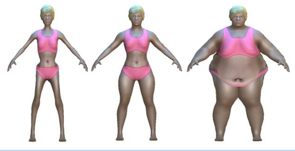
Figure 1: 3D Avatar illustrating the underweight – average – obese continuum (anterior).

The questionnaire that was used was not pre-validated and was designed in line with literature relating to body image and body dissatisfaction amongst females [22]. A pilot study was conducted prior to data collection to reduce the risk of participants' confusion and to ensure their understanding of the given questions. In doing so, it reduced any risk of typing/wording errors, respondent confusion and bias [1]. The questionnaire consisted of closed questions and was presented in 3 parts (A: personal details; B: Calculated BMI and C: Perceived Body Image). Whilst the preferred approach to this study would have been to use a 3D image of a woman that is able to rotate 360° and can visually slide from underweight to average to obese continuum, this was unable to take place due to COVID-19 pandemic. The software for the computer generated avatar was unable to be accessed, therefore, alternative 2D screen shots were taken illustrating 10 different images (ranging from anterior, lateral, and posterior and from underweight to average to obese continuum) (see Figure 1). Participants were asked to identify one of the images which best represented their body, thus their perceived BMI.