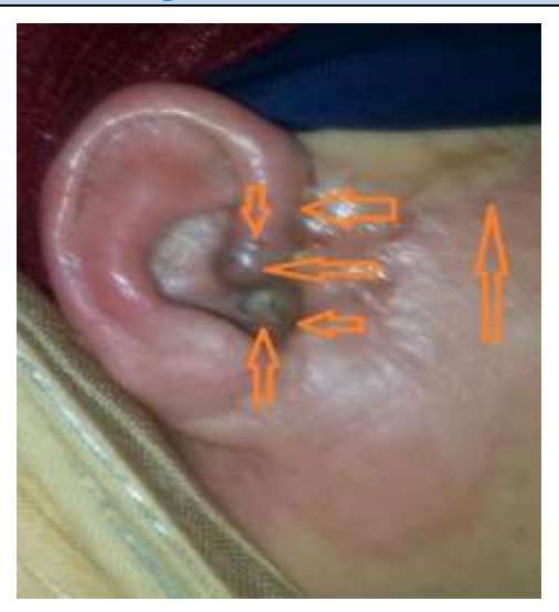
Figure (3): Right ear; Basal Cell Carcinoma (BCC) seen in the skin of ear and adjacent areas, slight edema seen after Bee Venom subcutaneous injection.