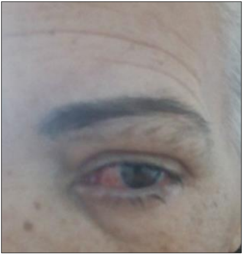
Figure 2: The left eye was erythematous with swelling and redness.

Metronidazole. On day 3 after admission, an ophthalmic examination was perfored as the patient complained of a painful left right eye with low visual acuity (figure 2).