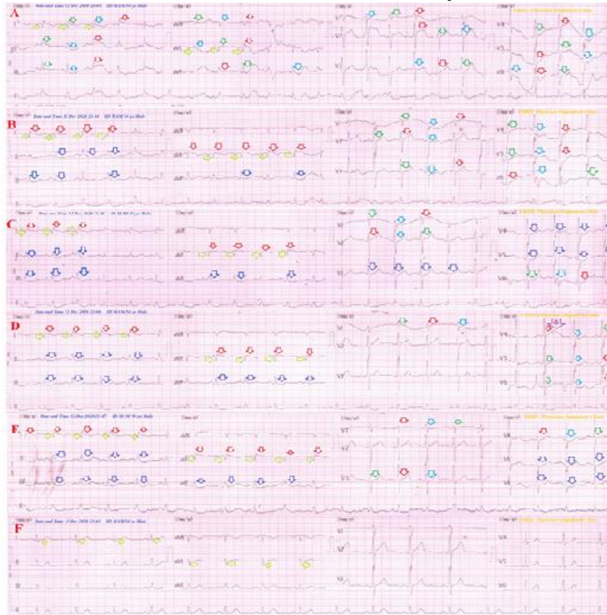
Figure 1: Serial ECG tracings.

of VR 67 (Figure 1F). Within 40 minutes of the above management, the patient finally showed nearly complete clinical and ECG improvement. Then, two-calcium gluconate ampoules (10ml 10%) over IV over 20 minutes was given. The patient was continued on oral calcium, and vitamin-D preparation for 30 days with further advised cardiac and endocrinal follow-up.