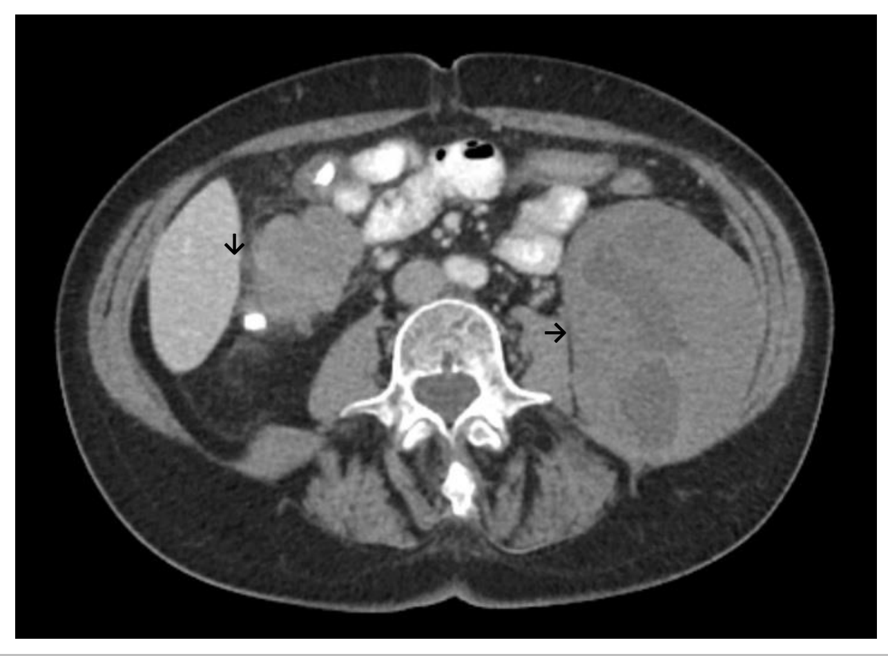
Figure 2. Transverse view of left retroperitoneal and paraduodenal mass

Horizontal arrow pointing to the left retroperitoneal mass extending from below the inferior pole of the left kidney into the pelvis. Vertical arrow pointing to the mass involving the second portion of the duodenum extending to the hepatic flexure.