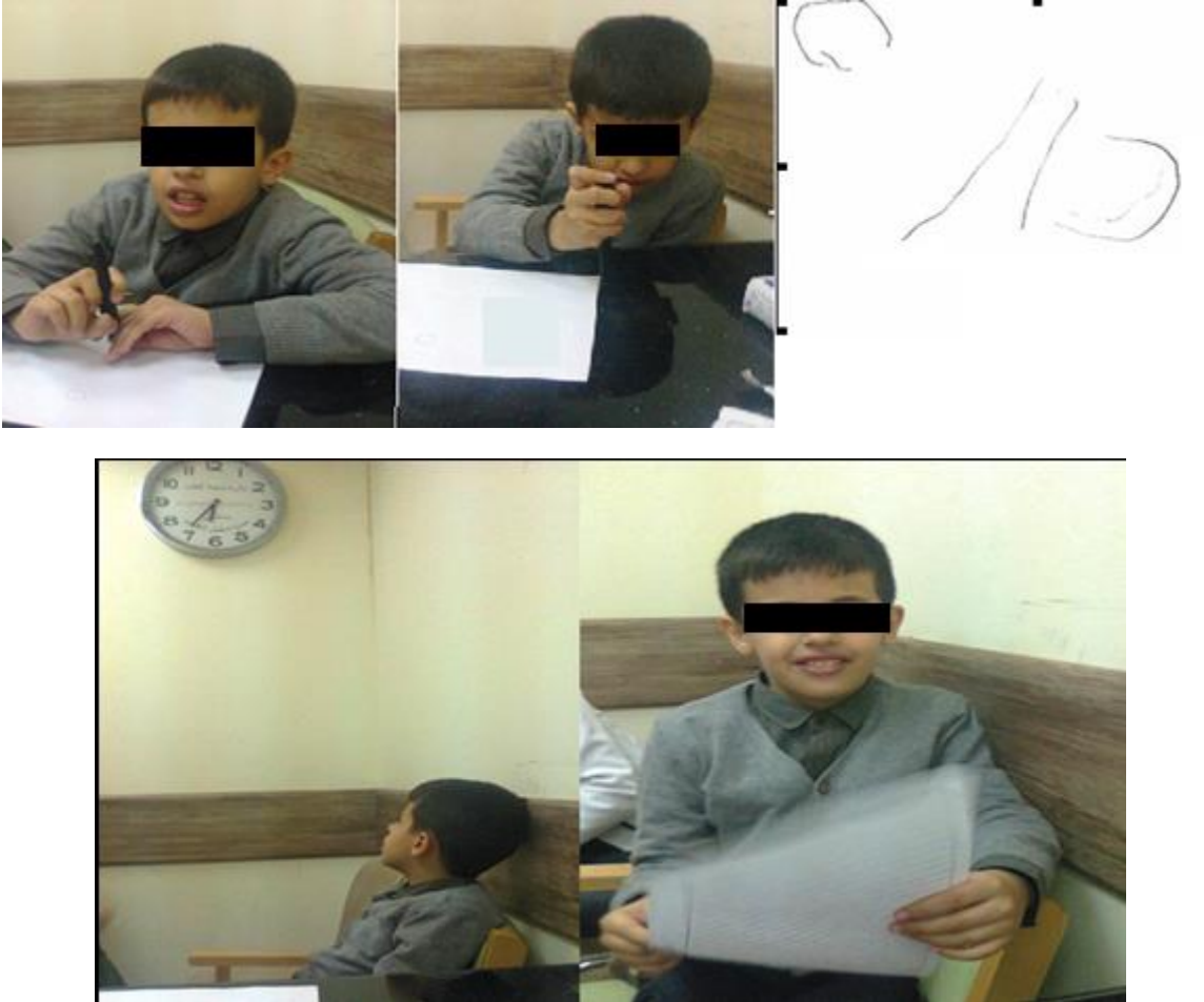
Figure-2: When his name was called more than one time to bring his attention and asked to look on the O clock on the wall, he looked at the wall. The boy was also responsive to his mother when she asked to make a cheese to take a photo and looked at the camera

the pen instead of drawing. The boy could draw circle, but the word he wrote was not that good. When his name was called more than one time to bring his attention and asked to look on the O clock on the wall, he looked at the wall (Figure-2).