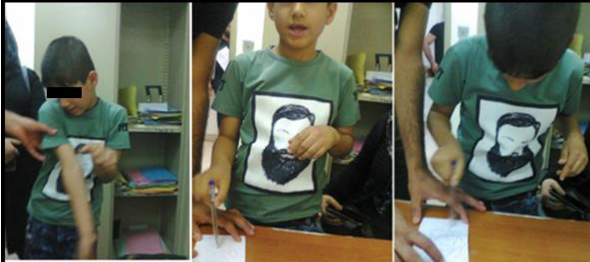
Figure 1: The boy was hyperactive, not responding to calling his name, and it was difficult for the mother to make him sit down

He had minimal, if any eye contact and was not looking at faces. When he sat on the chair he was not looking at the doctor, and when the mother gave him a pen he didn't follow the doctor's request to draw a line or scribble. The mother and his sister convinced him to try to draw a line, but he could only scribble.