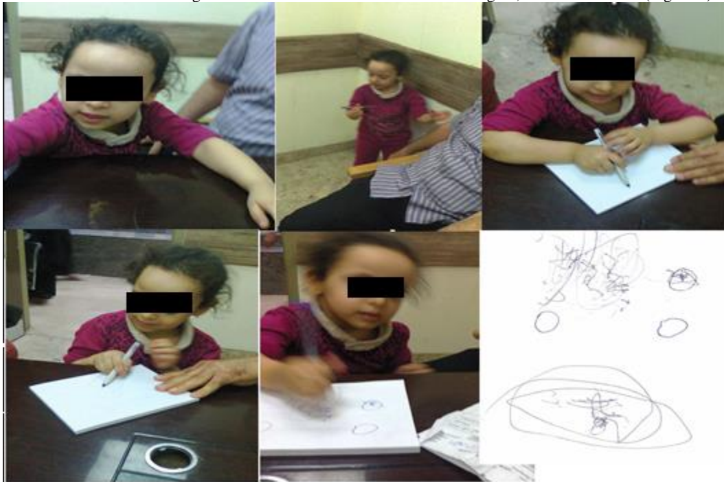
Figure-2: It was possible to have her attention, and it was possible with help of the father to make the girl interested in a pen and she took the pen. It took some time to make the girl try to draw a line and a circle. The girl scribbled and could draw a circular figure, but not a circle.