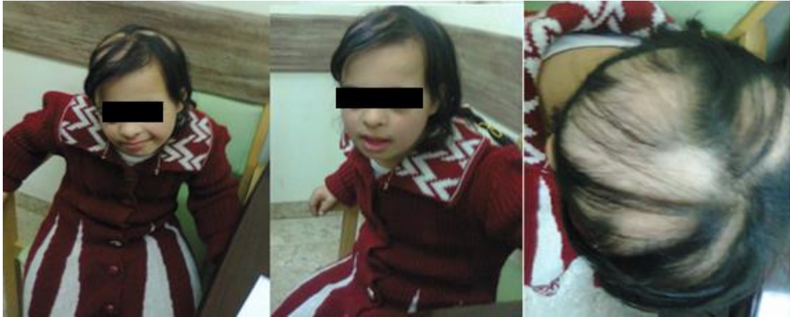
Figure-1: The patient was first seen on the 13 th of November, 2017 at the age of 13 years, and she had alopecia