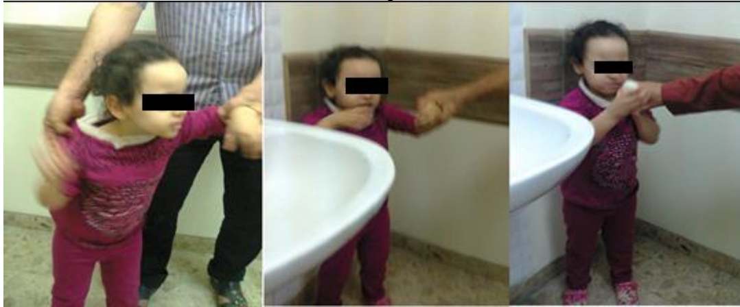
Figure-1: At the clinic, the girl was very hyperactive and very difficult to control, but she became interested in the soap and tried to eat it. Thereafter, it was possible to have her attention, it was possible to make her interested in a pen and she took the pen. It took some time to make her try to draw a line and a circle. The girl scribbled and could draw a circular figure, but not a circle (Figure-2).

At the clinic she was very hyperactive and was very difficult to control, she was not interested in taking photos and was obviously reluctant to look at faces. However, she became interested in the soap and tried to eat it (Figure-1).