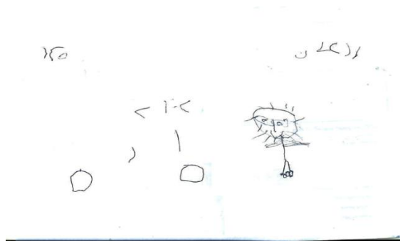
Figure-3: At the clinic the boy copied a line, circle, and numbers one, two, four, and five. He was also successful in drawing a man. He also tried to copy his name

1-In this case the patient aged five years and eight months, and he was saying only few words including the names of his brother and two sisters. He was not saying any two-word sentence. Which of the following statements is true regarding normal speech development?