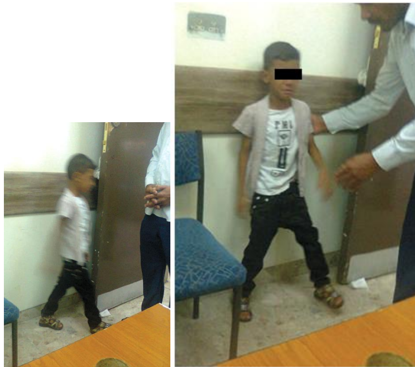
Figure-1: The child was not responsive to any questions and didn't like taking photo and tried to escape from the examination room

The medical treatment enabled the family to teach him many things. They brought his drawings at home including a circle, a square, the sun, a flower, and a face (Figure-2). He was also saying two-word sentences to express some needs. With family help he accepted to write and draw at