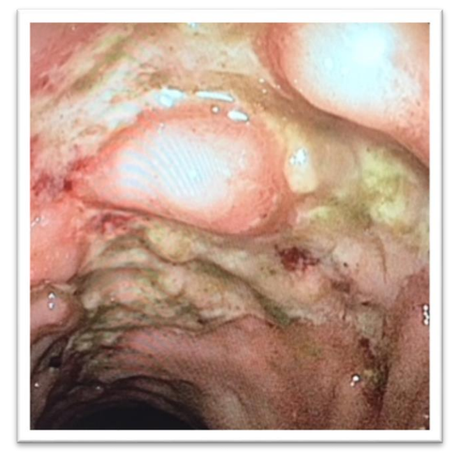
Image 2: Colonoscopy at rectosigmoid region showing ulcers with white slough

There was thin streak of fluid in the abdomen. A colonoscopy performed revealed multiple linear and deep ulcerated lesions with white slough both in sigmoid colon and rectum up to 30 cm with fragile mucosa (Image 2).