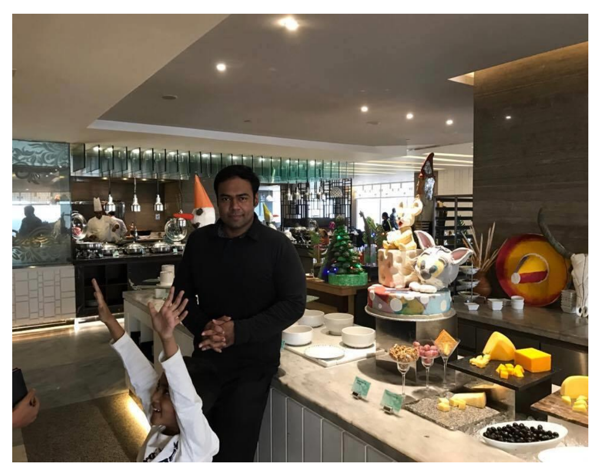
Figure 2. The Author