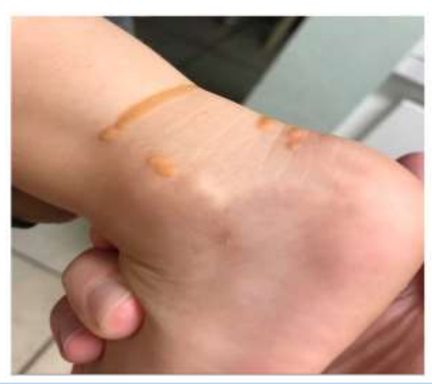
Figure 1: Xanthomatous lesions over right ankle. Classic appearing pediatric xanthomas are seen.