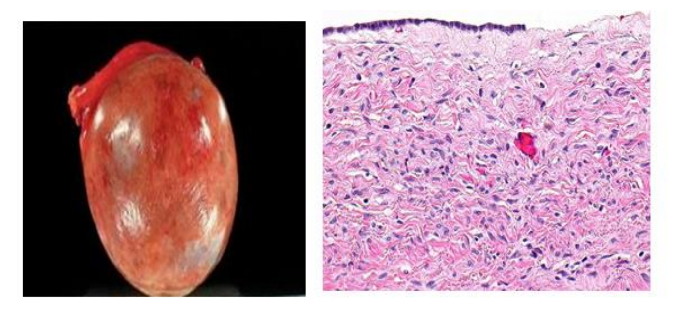
Figure 5 and 6: Serous Cystadenoma and histology of the tumor showing the cystic space is at the top of the image. Ovarian parenchyma is seen at the bottom right. H&E stain.