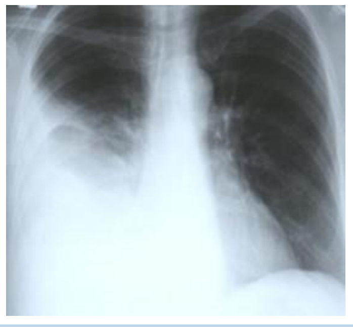
Figure 1: Showing right sided pleural effusion

The patient was discharged on 11<sup>th</sup> postoperative day in a healthy condition. She came for follow up after 6 weeks with a repeat abdominal USG and chest X ray which showed complete disappearance of the ascites and right sided pleural effusion.