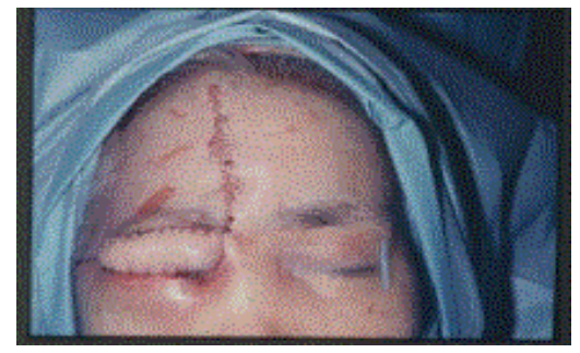
Figure 2 Post-operation