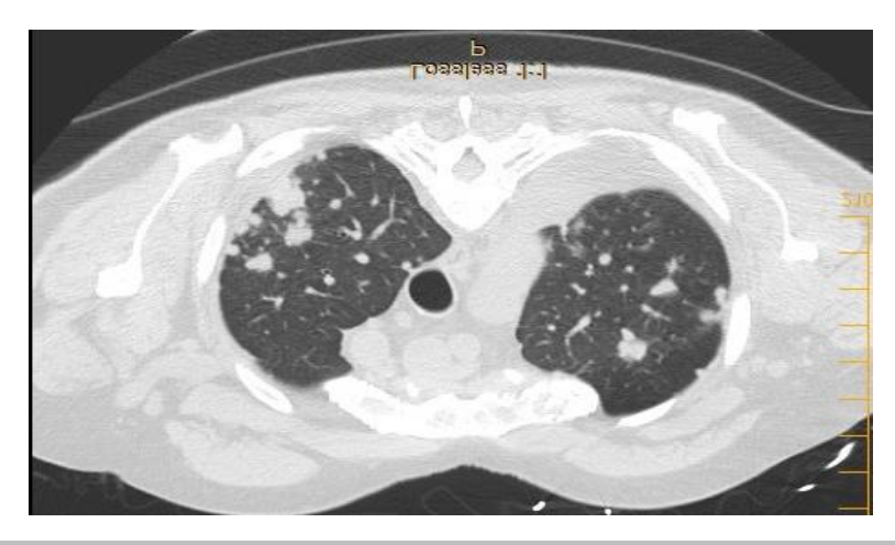
Figure 2: Axial CT chest showing multiple pulmonary nodules in the right upper lobe. Black arrow pointing to RUL nodules

His rheumatologist planned to start him on TNF-alpha inhibitors for his RA and wanted to evaluate for infections and malignant causes prior to proceeding with the treatment. He was asymptomatic and denied any respiratory complaints. At the time of presentation, he was being treated with leflunomide, hydroxychloroquine and sulfasalazine. Pt is a Navy veteran with exposure to asbestos while he was in the Navy. Following his discharge from the Navy, he worked 10 years overseeing production of plastic and metal parts for guided radar systems. He then transitioned to working in residential construction, hanging, siding and replacing windows. He also worked on restoring brick on old houses by stripping off paint for about 5 years.