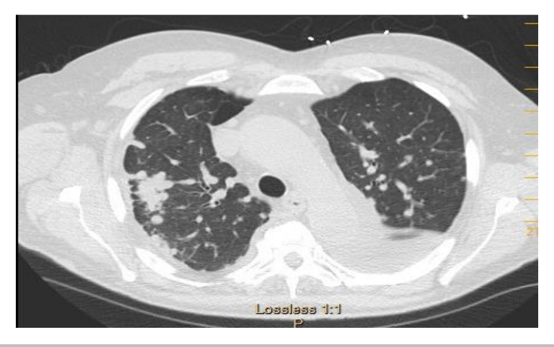
Figure 1: Axial CT chest showing nodules coalescing in to one large conglomerate. Black arrow pointing to coalescing nodules.

peri-lymphatic pattern (Figure 1). Patient was noted to have progressive pulmonary nodules that have been increasing in size (Figure 2).