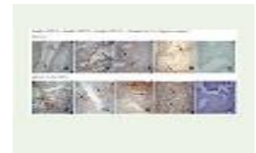
Figure 1: Comparison of plasma IL-6 levels between cancer, precancer and healthy controls. The central box represents the value from the lower to upper quartile. Significance (p<0.05) assessed SPSS 14.0.

Among the patients with squamous cell carcinoma, 27 patient had well differentiated tumor, 9 had moderately differentiated and the rest of 7 cases belonged to poorly differentiated squamous cell carcinoma.