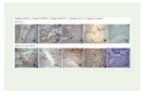
Figure 3: Immunohistochemistry (Semi-quantitative) analysis of STAT3 (A-E) and pSTAT3 (Tyr 705) (F-J). The samples were marked into various grades of CIN (A, B and C) and in SCC (D) grade based on the presence of positive cells (arrow indicate positive cells). (magnification 200 X).

In addition to these, the levels of IL-6 were compared and confirmed in activating STAT3 and p-STAT3 signaling pathway. Results of the investigations (Figure 3) suggest that, a significantrelation exists between expression of STAT3 and pSTAT3 in precancerand cancer. For STAT3 28.6%, 61.1%, 68.0%, 27.9% and control 12.5% (P=0.001), similarly for pSTAT3 42.9%, 72.2%, 80.0%, 83.7% and control 12.5% respectively (P<0.001). But when compared to precancer in cancer STAT3 is 56.1% and 27.9% (P=0.005), whereas pSTAT3 is 68.4% and 83.7% were P<0.080 respectively. For STAT3 CIN 1 staining confined to the lower one third (Figure 3D), CIN 2 staining confined to the lower 2/3 of the epithelium, (Figure 3D), and SCC staining of malignant cells as compared to control (Figure 3E). STAT3 immuno-staining shows intense cytoplasmic staining that clearly highlights the lesion cells, but no nuclear positivity. Whereas P-STAT3 shows strong nuclear and cytoplasmic expression as compare to pre-cancer stage. In control sample neither STAT3 nor pSTAT3 was present in mature superficial squamous epithelial cells (Figure 3Eand Figure 3J). Further, a significant intra-relationship was found between the expression of STAT3 and pSTAT3 in cervical cancer.