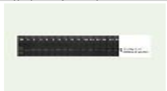
Figure 2: RT-PCR expression level of IL-6 gene expression showing, 232 bp amplimer are seen. Lane M-Molecular Marker É X174 DNA-HaeIII Digest, lane 1-5 cervical cancer, lane 6-10 pre-cancer and lane 11-15 normal sampels.

In addition to these, the levels of IL-6 were compared and confirmed in activating STAT3 and p-STAT3 signaling pathway. Results of the investigations (Figure 3) suggest that, a significantrelation exists between expression of STAT3 and pSTAT3 in precancerand cancer. For STAT3 28.6%, 61.1%, 68.0%, 27.9% and control 12.5% (P=0.001), similarly for pSTAT3 42.9%, 72.2%, 80.0%, 83.7% and control 12.5% respectively (P<0.001). But when compared to precancer in cancer STAT3 is 56.1% and 27.9% (P=0.005), whereas pSTAT3 is 68.4% and 83.7% were P<0.080 respectively. For STAT3 CIN 1 staining confined to the lower one third (Figure 3D), CIN 2 staining confined to the lower 2/3 of the epithelium, (Figure 3D), and SCC staining of malignant cells as compared to control (Figure 3E). STAT3 immuno-staining shows intense cytoplasmic staining that clearly highlights the lesion cells, but no nuclear positivity. Whereas P-STAT3 shows strong nuclear and cytoplasmic expression as compare to pre-cancer stage. In control sample neither STAT3 nor pSTAT3 was present in mature superficial squamous epithelial cells (Figure 3Eand Figure 3J). Further, a significant intra-relationship was found between the expression of STAT3 and pSTAT3 in cervical cancer.