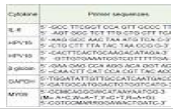
Table 1: Primer sequences used for the PCR amplification of target sequences.

High molecular weight genomic DNA was isolated from all tissue biopsies by phenol-chloroform extraction procedure [12]. The PCR for detection of DNA of HPV types 16 and 18 were carried outusing type-specific primers. All tissue biopsies were tested for HPV type using a pair of consensus primers (Table 1) designed for the sequences located within the conserved L1 ORF of HPV genome. PCR was performed in a 25 µl reaction mix containing 100 ng DNA, PCR buffer with magnesium chloride at final concentration 1.5 mM, 125 µM of each dNTPs, 5 pmol of each oligonucleotide primer and 0.5U Taq DNA polymerase were used. The temperature profile used for amplification constituted an initial denaturation 95 °C for 5 min followed by 35 cycles with denaturation at 95 °C for 30 sec, annealing at 55 °C for 30 sec and extension at 72 °C for 1min which was extended for 4 min in the final cycle. Amplification of βglobin gene which served as the internal control was carried out along with HPV.