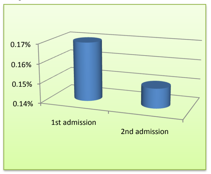
Figure 2:Graphic illustration of first and recurrent admissions' suicidal behavior.

The annual incidences of suicidal behavior in both groups were comparable, and they were around 0.035% and 0.030%, in first admission and recurrent admission psychiatric inpatients, respectively (Table 1). Besides, with respect to different components of serum lipids, no specific or significant pattern was evident, except that all hypolipidemic patients (n=7) were diagnosed as major depressive disorder, while 80% of hyperlipidemic patients (n=5) were diagnosed as bipolar I disorder (Table 4).