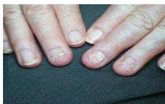
Figure 1 Nails prior to treatment.

This patient did not want the risk of oral therapy; therefore, laser therapy was an excellent option with little to no side effects. The laser was set at fluence 16J/cm<sup>2</sup>, pulse duration 0.2m sec and repetition rate 3.0 Hz. Each fingernail received 200 pulses, the thumb received 100 pulses, and the fifth fingernail received 50 pulses. Excellent clinical results were noted after 4 weeks (Figure 3). The patient remains in remission to date (24 months).