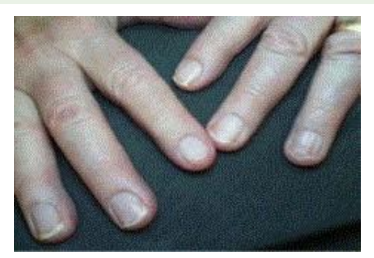
Figure 3 Four weeks post treatment