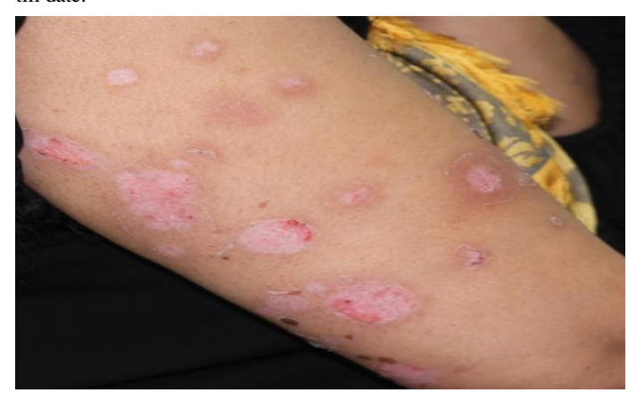
Fig 6: Healed lesions after treatment with steroids

Skin biopsy was sent for histopathology and direct immunofluorescence (DIF) with provisional diagnosis of Linear IgA bullous dermatosis. Treatment was started with parenteral steroids, as dapsone, the drug of choice in this condition was not readily available. Inj Hydrocortisone 100 mg 8 hrly IV was given for the first 48 hrs and then switched over to oral Prednisolone 60 mg daily for a week, tapering to 40mg for another week and then by 10mg every week. There was immediate response to steroids and the patient improved in 48 hours. She was then given oral steroids which were gradually tapered over 5 weeks. Lesions on skin and mucosa completely healed (Fig 6). There was no relapse during tapering the steroids or thereafter till date.