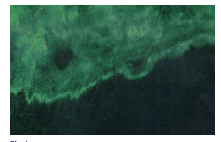
Fig 4: Skin biopsy DIF: Strongly positive linear band of IgA at dermoepidermal junction