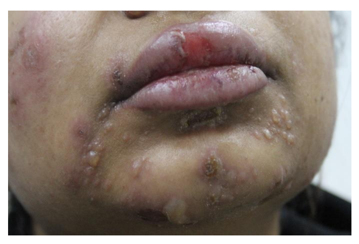
Fig1: Multiple vesicles around the mouth in grouped and linear arrangement.