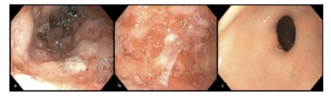
Figure 1: Endoscopic view of markedly thickened gastric folds, with overlying erosions and exudates involving the gastric fundus (a), body (b), and unaffected antrum (c).

Upper endoscopy revealed severe erosive gastritis involving gastric fundus and body, with normal mucosa in the gastric antrum ( Figure 1 ).