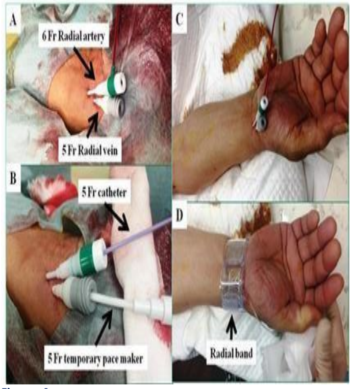
Figure 1: Procedures of radial artery and vein approach catheterization and hemostat device of radial band